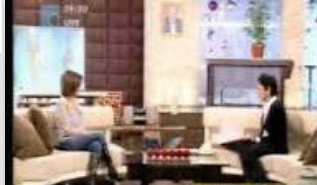
Future TV Interview with LibanPost's Marketing Director to talk about stamps in Lebanon