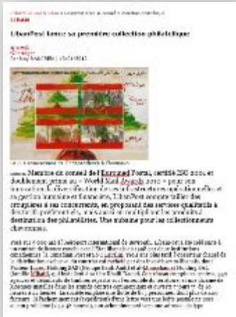
L'Orient le Jour