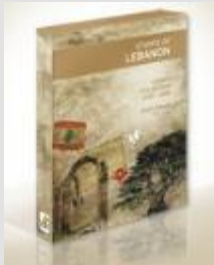
2000-2004 Collections Package