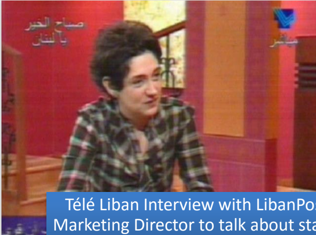
Télé Liban Interview with LibanPost's Marketing Director to talk about stamps in general and Yearly Collections