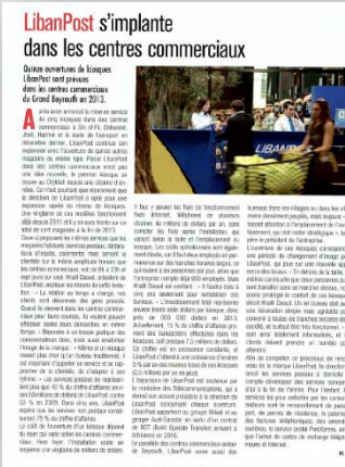
The Commerce du Levant Magazine