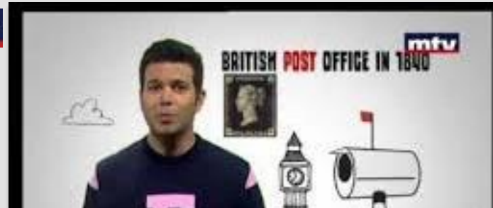
Every night right before the News, a short episode on MTV called "min AI" brings facts and advice on a new topic related to our daily lives. LibanPost provided all the needed info to make a special episode about Stamps' culture.