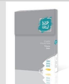
2011-2013 Collections Package