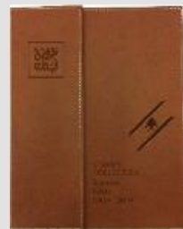
2005-2010 Collections Package