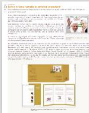
International Vaccari News - Italy