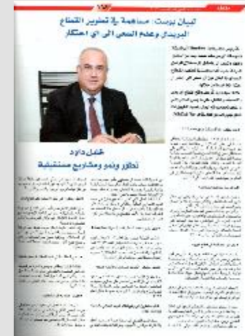
Al Morakeb Al Inmai Magazine