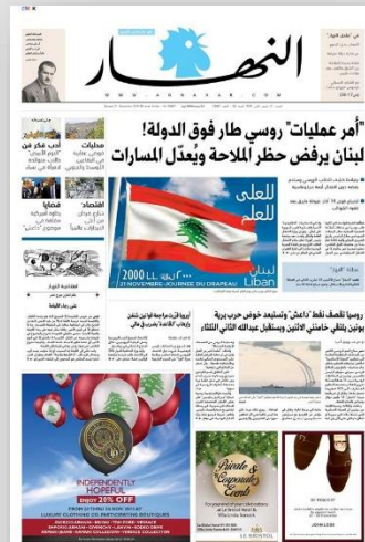
An Nahar Newspaper