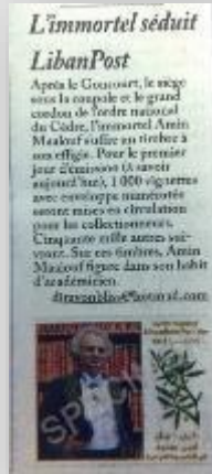
L'Orient le Jour