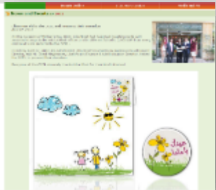
Children Cancer Center website