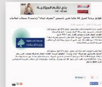
El Nashra online news