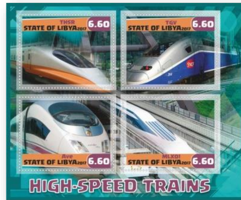
Libya 2017 – Sheetlet of 4 stamps