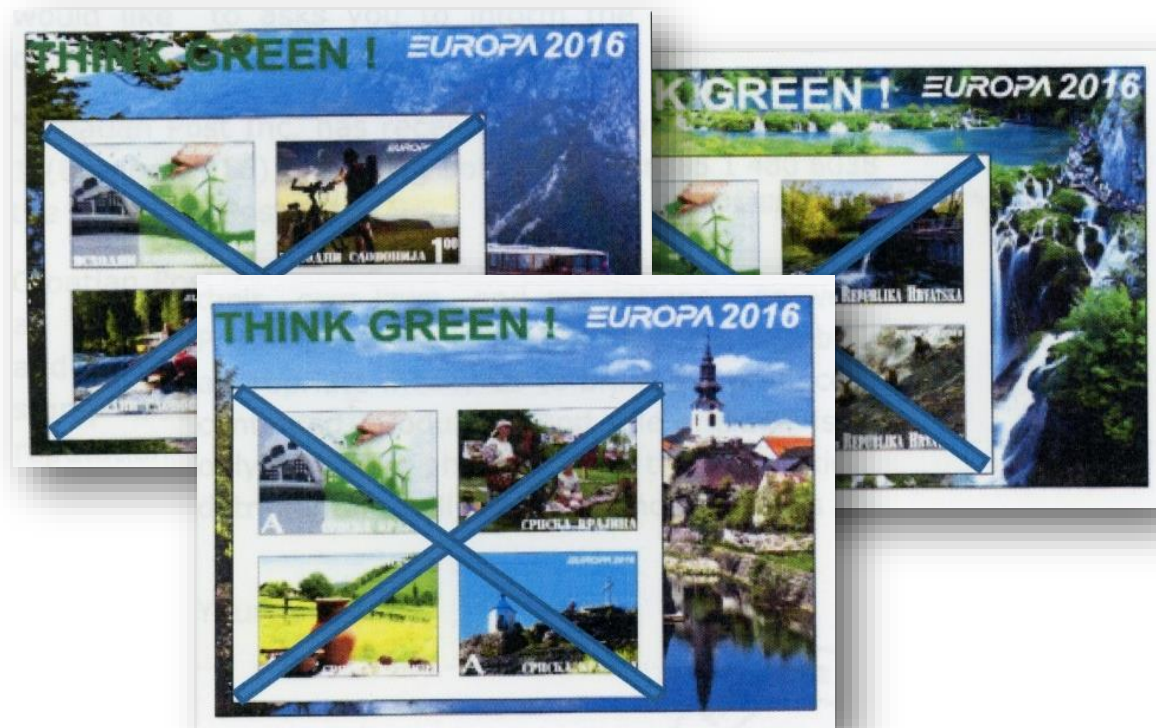
Croatia 2016 – 3 sheetlets of 4 stamps