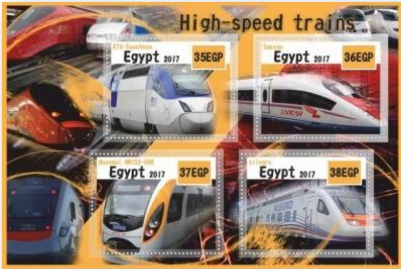
Egypt 2017 – Sheetlet of 4 stamps